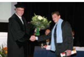
Presentation of the 250th PPD-diploma

During the PPD program you will be exposed to, and actively involved in applying, technologies to an extent that would never be possible if you were only working in industry. To gain the same experience would take, if possible at all, many more years in industry. The PPD program is unique: dedicated courses, industrial assignments, industrial lecturers and management team members who themselves are active in the process industry. As a Trainee Technological Designer you will receive a salary of around € 1650 gross per month. After successfully completing our program, you will be granted the degree of 'Professional Doctorate in Engineering' (PDEng).